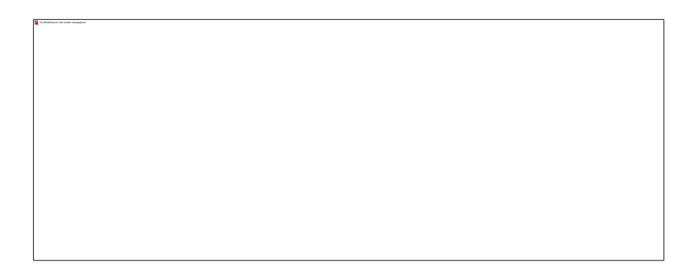
Figure 1 The distribution of growing stock by tree species (Yearbook Forest 2018).

For logging in any type of forest, it is required that a valid forest inventory or forest management plan, along with a forest notification issued by the Environmental Board, is available. All approved forest notifications and forest inventory data is available in the public forest registry online database.