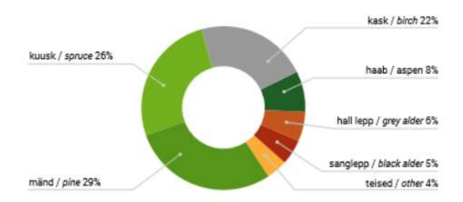
Figure 1 The distribution of growing stock by tree species (Yearbook Forest 2017).

For logging in any type of forest, it is required that a valid forest inventory or forest management plan, along with a felling permit issued by the Environmental Board, is available. All issued felling permits and forest inventory data is available in the public forest registry online database<sup>9</sup>.