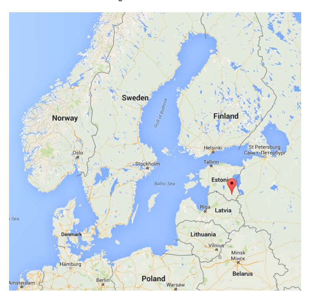
Figure 1. Location of Warmeston OÜ's Järvere plant

WARMESTON OÜ is an Estonian based wood pellet producer which owns three production facilities in Estonia. The current SBR describes the facility located in the southern part of the country in Järvere village, Võru Parish as indicated in Figure 1.