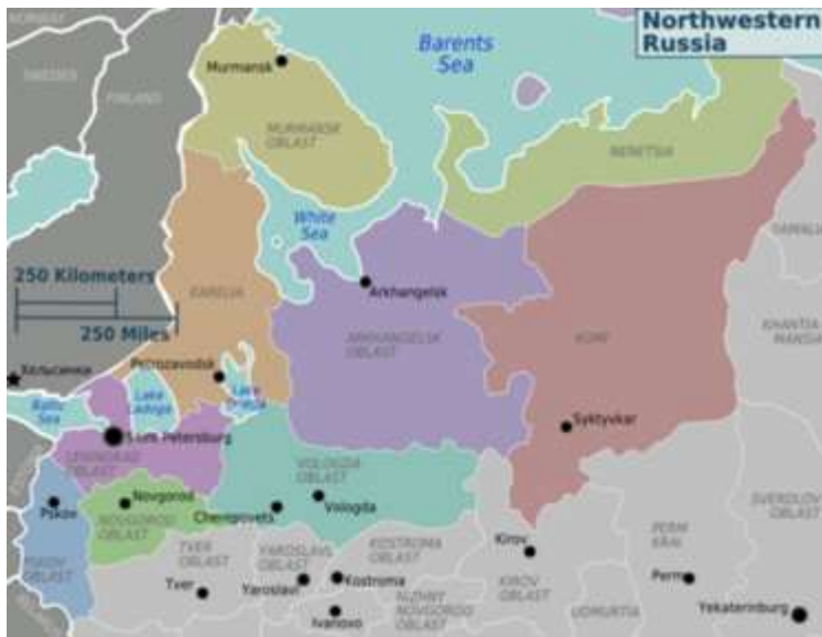
Figure 2. Northwest Russia

The Russian Federation has the world's largest forests, comprising 1/5 of the Earth's total forest cover, 71% of which are coniferous. Half of the country's territory is covered with forests; however, only 50% of these forests are economically accessible. Russian forests are usually divided into four major geographic regions: European Russia, Western Siberia, Eastern Siberia, and the Russian Far East.