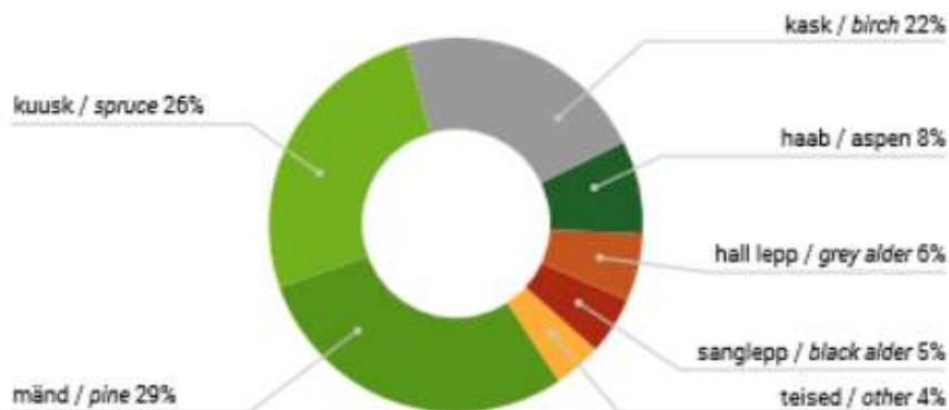
Figure 1 The distribution of growing stock by tree species (Yearbook Forest 2017).

For logging in any type of forest, it is required that a valid forest inventory or forest management plan, along with a felling permit issued by the Environmental Board, is available. All issued felling permits and forest inventory data is available in the public forest registry online database 9 .